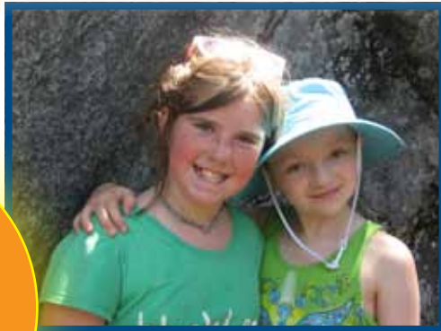
The Skylake Yosemite Camp Newsletter

ENROLMENT IS NOW AVAILABLE ON LINE www.Skylake.com