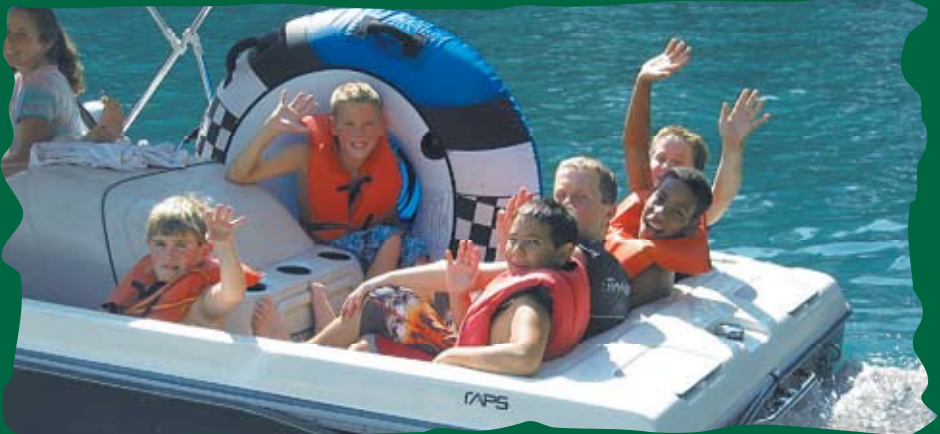
Bass Lake provides a beautiful waterskiing site. Located just down the swim trail from camp, the lake is warm and wind free. Great for swimming, kayaking and boat activities.