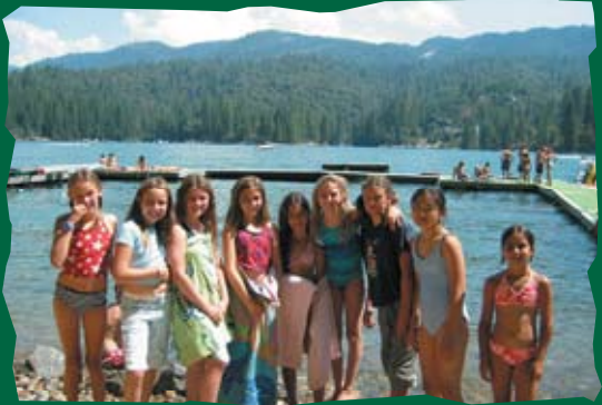
Just plain fun is what camp is all about. Lots of free activity time allows the campers to let their hair down and enjoy a "kids vacation"