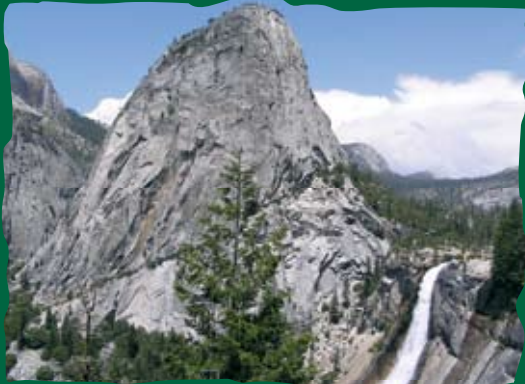
Yosemite is only 15 miles from camp. Campers head for the valley for day trips, backpacking trips, and the ambitious "Dome in a Day" hike.