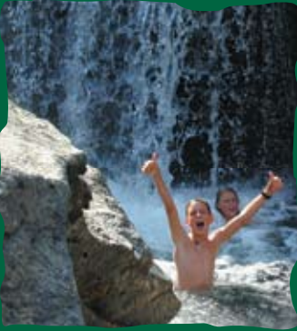
Located in the Sierra National Forest, Skylake's private acres stretch into miles of outdoor living space.