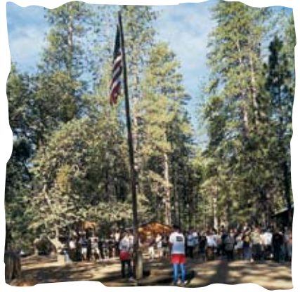
Morning reveille at Skylake

If the word "Skylake" was in a dictionary its definition would be "a place to make friends and create memories." The traditions include nightly campfire, Cabin Group Activities, Big Sisters, Skylake Reflection Hour, picnic barge, Length of the Lake Swim, Dome in a Day, milkshakes from Millers, "Fat Pills", camp songs, camp skits, the "crying line", and the endless special times created by the counselors. Even reveille and the morning flag salute take on special significance at Skylake.