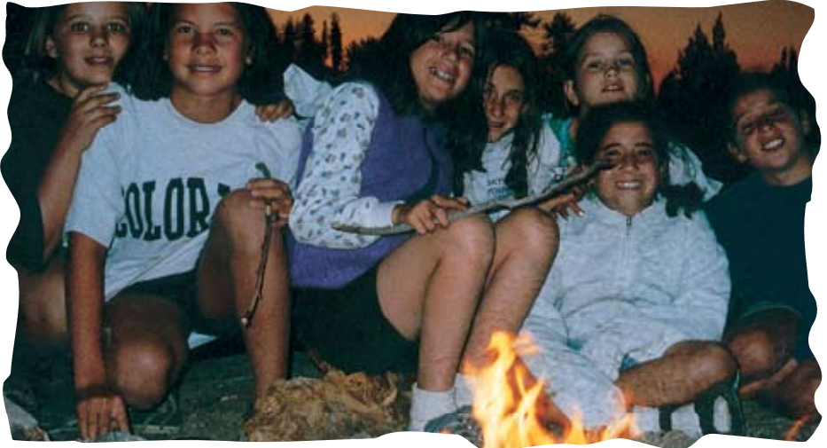
Campfires at Skylake